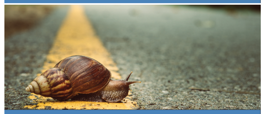
But, Sometimes Speed is What You Need